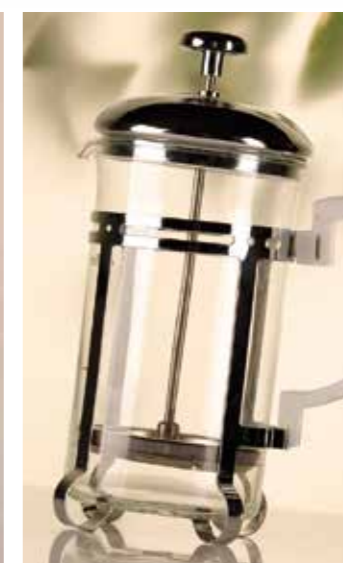
Blown glass teapot.