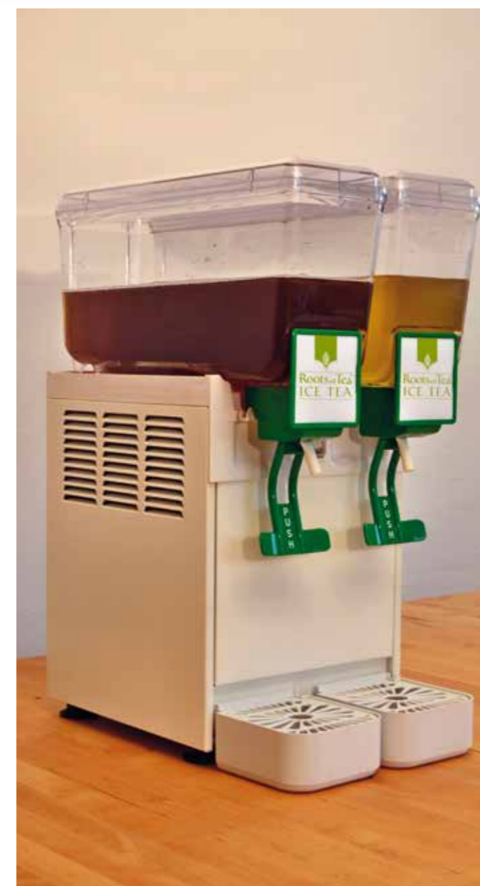
Beverage dispenser. Dimensions: 25 x h 55 x d 40 cm